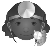
Health and Human Services