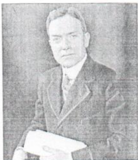
John D. Rockefeller, Jr

businesses successful. Andrew Carnegie established the first steel mills in the U.S. to use the British "Bessemer process" for mass producing steel, becoming a titan of the steel industry in the process. He acquired business interests in the mines that produced the raw material for steel, the mills and ovens that created the final product and the railroads and shipping lines that transported the goods, thus controlling every aspect of the steel-making process.